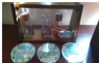
Pasteur's scientific experiment, on display in Thackray Medical Museum.

Louis Pasteur proved that germs caused disease. He published his Germ theory in 1861.