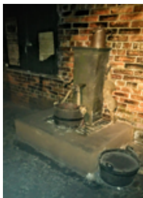
A communal water pump from Thackray Medical Museum's 1842 Street.

In 1854, Dr John Snow took the handle off the Broad St pump, to prove that cholera was spread by infected water.